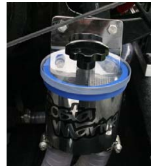
The CM Weed Strainer is easily fitted to most boats

The CM Weed Strainer is manufactured from 316 stainless steel and fitted with a poly carbonate lid. Small and extremely robust it can be fitted to almost any boat. You can increase the performance and safety of your boat by fitting a CM Weed Strainer.