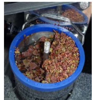
Without a CM Weed Strainer all this weed and debris would have been sucked though a brand new motor